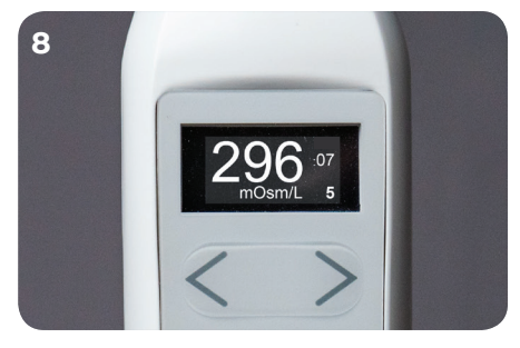
To view previous test results, press either the right (>) or left (<) buttons on the Pen.