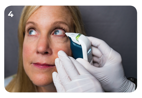
Seat patient with head back and eyes looking up and towards ceiling.