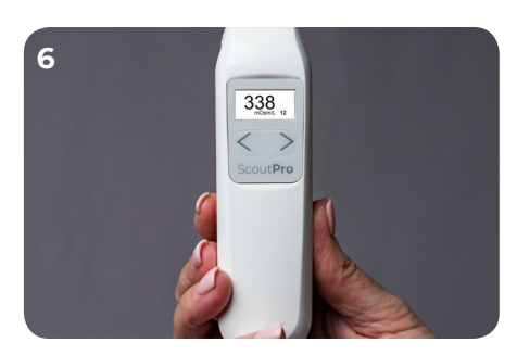
A test result will appear on the display. DO NOT DOCK the Pen while waiting for results. Record the test result in the patient's chart.